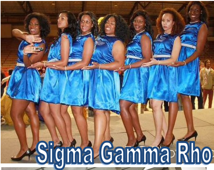
Sigma Gamma Rho