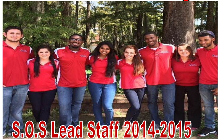
S.O.S Lead Staff 2014-2015