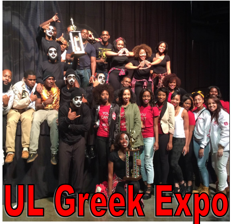
UL Greek Expo